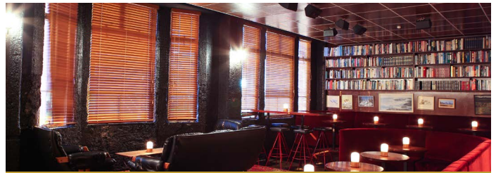
seated capacity 75