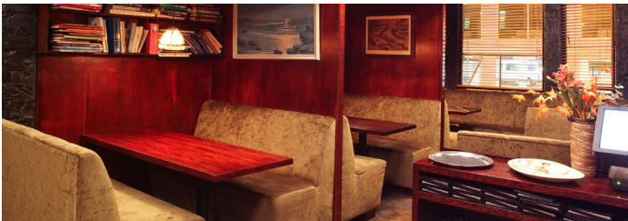
standing capacity 45

The Reading Room is a seated area complete with many booth and a raised area with free moving furniture. This is a wonderful space for smaller groups to enjoy some drinks and nibbles. Alternatively, it can be used to add additional capacity for your event and provide an area for your guests to sit down, relax and unwind.