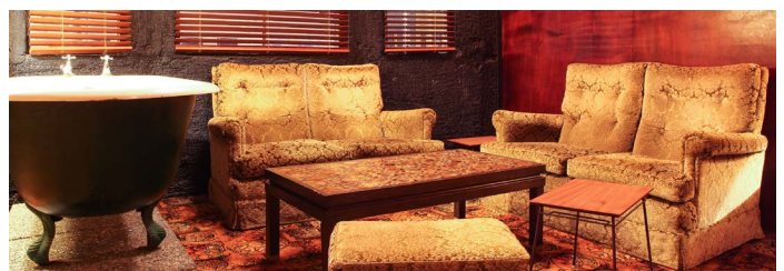
seated capacity 30