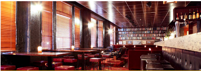
standing capacity 120

Please note: Booking this area is often restricted to full venue functions.