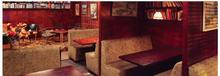
seated capacity 40